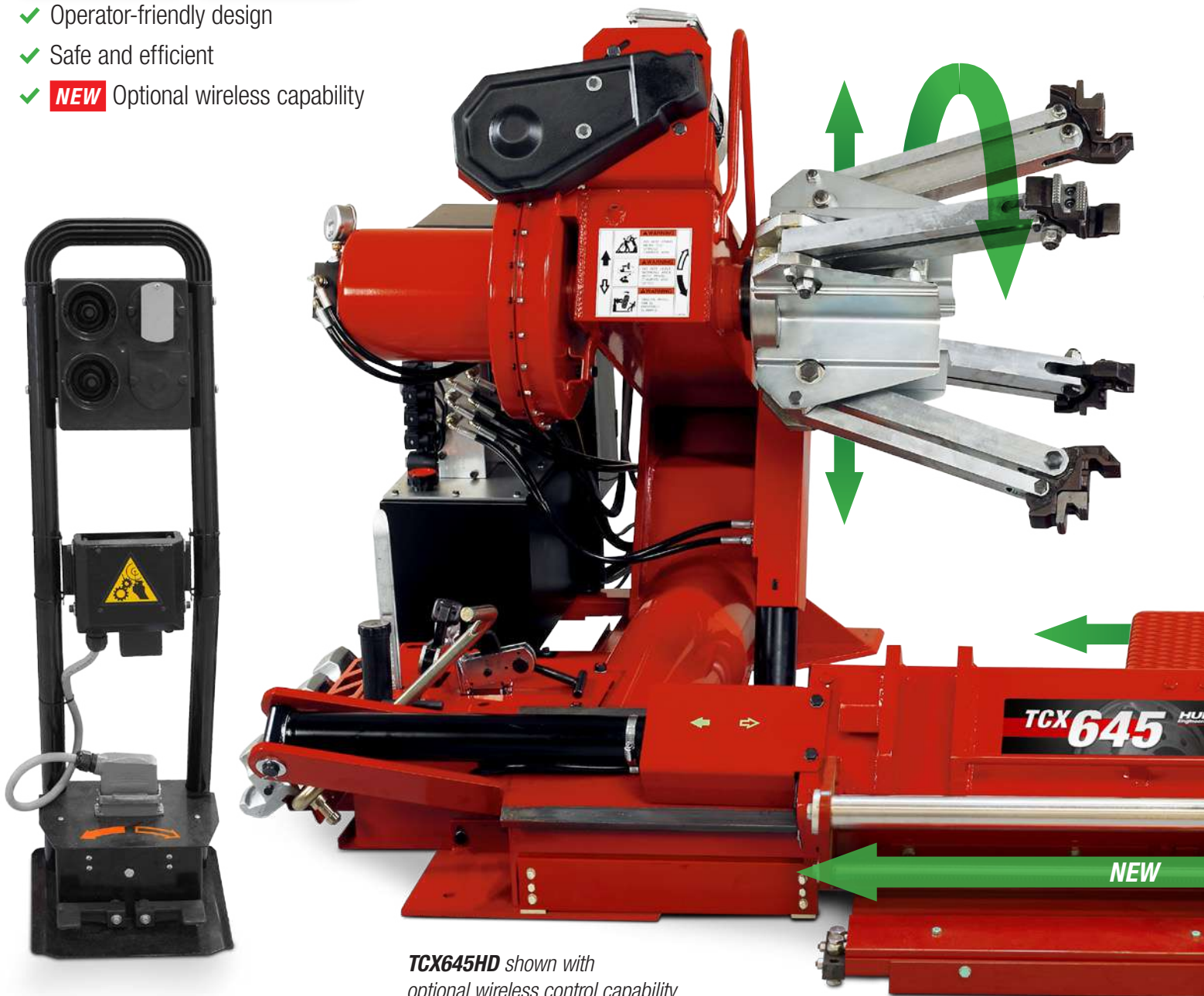
TCX645HD shown with optional wireless control capability